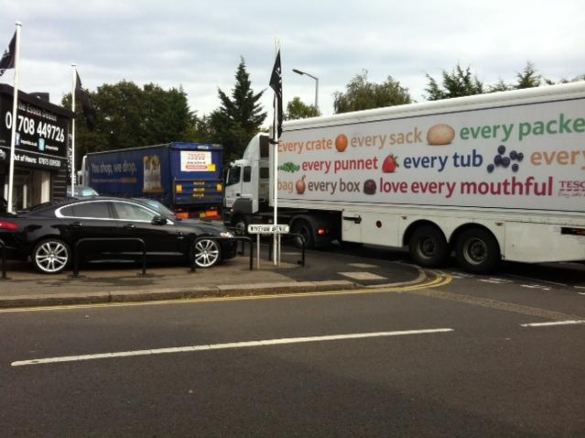
Looking from Wykeham Road onto Butts Green Road